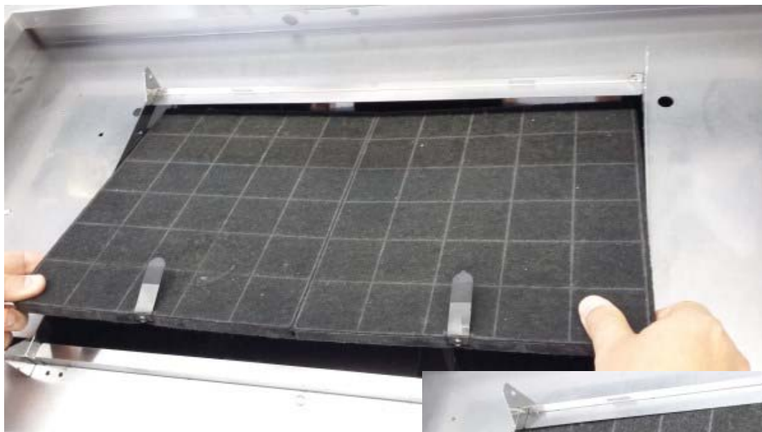
Positioning of charcoal filter